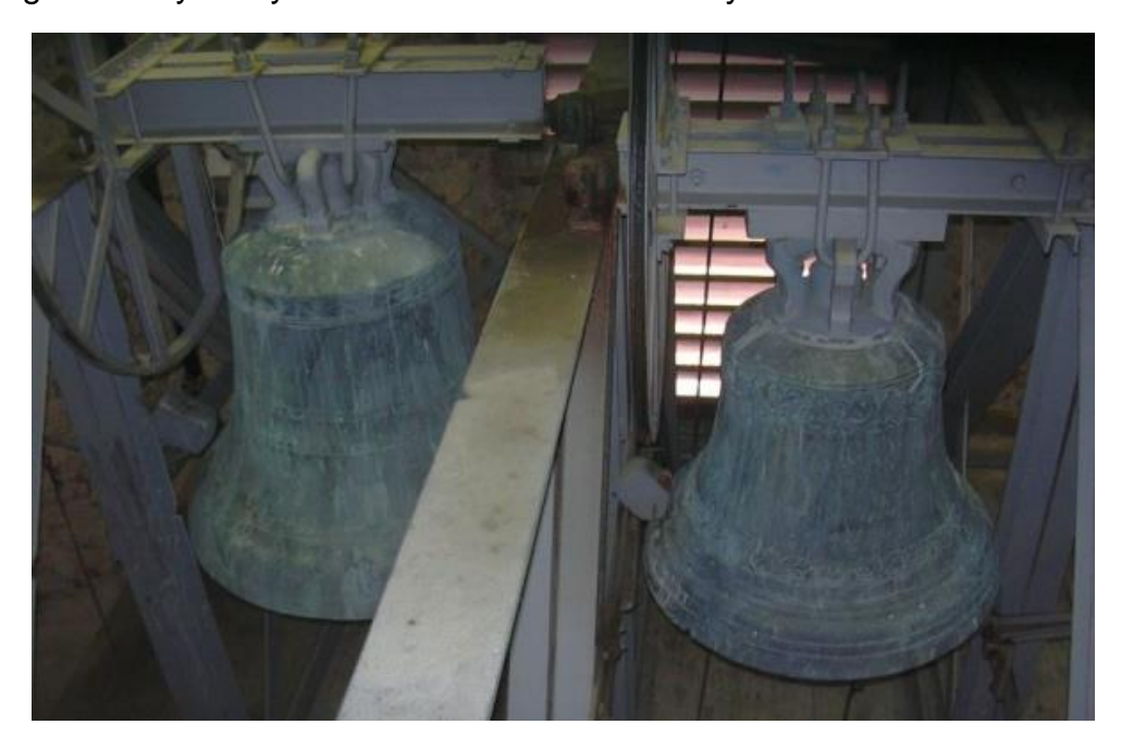
Figure 1: The big and the middle sized bell in February 2015 before reconditioning

The history of the Liedolsheim church bells is linked very often to acts of war. Therefore I am happy to write this article on an occasion, where not war, but normal wear makes reconditioning of the bells necessary. This need for reconditioning inspired the following summary of my research on the bells' history.